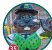
"Farmer's Phil" Sponsored by: Farmers National Bank, 102 Indiana St.