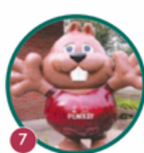
"Phil'd with Love" Sponsored by: Mulberry Square Elder Care and Rehabilitation, 411 1/2 W. Mahoning St.