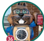
"Phil Phinancial" Sponsored by: First Commonwealth Bank, 573 W. Mahoning St.