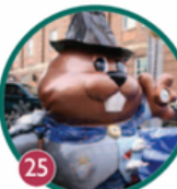
"The Wizard of Weather" Sponsored by: NW PA's Great Outdoors, located at Weather Discovery Center, 201 N. Findley St.