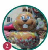
"Get Your Phil of Roses" Sponsored by: Roseman's Florist & Gifts, 126 W. Mahoning St.