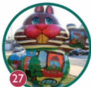
"Phil a House with Love" Sponsored by: The Jefferson County Housing Authority, 201 N. Jefferson St.