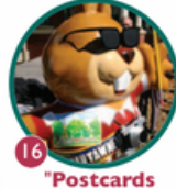
"Postcards from Phil" Sponsored by: Punxsutawney Rotary Club, PHAGS Latimer House, 400 W. Mahoning St.