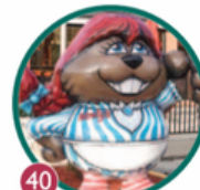
"Old-Fashioned Phyllis" Sponsored by: Wendy's, 212 Hampton Ave.