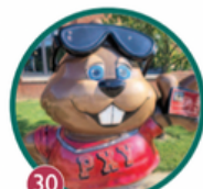
"IUPhil" Sponsored by: Punxsutawney Campus of IUP, 1012 Winslow St.