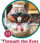
"Through the Eyes of Pizzaria Phil" Sponsored by: Laska's Pizzeria, 405 S. Main St.