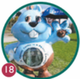
"Phil Your Piggy Bank" Sponsored by: S&T Bank, 232 Hampton Ave.