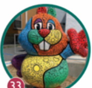
"Slice to Meet You" Sponsored by: Leila Jo's Cafe & Bakery, 246 W. Mahoning St.