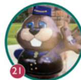
"Phil'd with Service" Sponsored by: Cobblestone Hotel & Suites, 188 Alliance Dr.