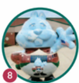
"Start to Finish" Sponsored by: Punxsutawney Area Middle School Student Gov't '04-'05 Middle School Patio, 465 Beyer Ave.