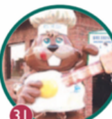
"Breakfast Sounds Good" Sponsored by: Gimmicks Restaurant, 208 Ridge Ave.