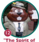
"The Spirit of Punxsutawney" Sponsored by: the Punxsutawney Spirit Newspaper, 510 Pine St.