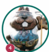
"There's Work to be Done" Sponsored by: Ragley's True Value Hardware, 248 N. Findley St.