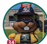
"Phil the Flames" Sponsored by: Lindsey Fire Company, 1010 W. Mahoning St.