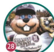
"Phil'd of Dreams" Sponsored by: Berkshire Hathaway Inc., 200 E. Mahoning St.