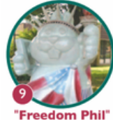
"Freedom Phil" Sponsored by: the Groundhog Festival Committee, 300 E. Mahoning St. Barclay Square, Punxsutawney