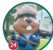
"Philatelic Phil" Sponsored by: the Employees of the Punxsutawney Post Office, 553 E. Mahoning St.

PRODUCED BY: www.punxsutawneymagazine.com hometown@punxsutawneymagazine.com #1068 2023