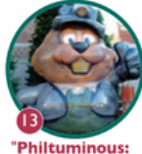
"Philtuminous: The Heritage Hog" Punxsutawney Area Historical and Genealogical Society, 404 W. Mahoning St.