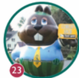
"You Can Bank on Phil" Sponsored by: Indiana First Bank, 8 Beyer Rd., across from Walmart

PRODUCED BY: www.punxsutawneymagazine.com hometown@punxsutawneymagazine.com #1068 2023