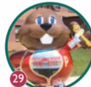
"Oh the Places We Will Go" Sponsored by: PAHS Art Club, Punxsutawney Area High School, 500 North Findley St.