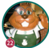
"Phil My Prescription, Please" Sponsored by: the former Stewart's Drug Store, 217 W. Mahoning St.