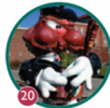
"Presby MacPhil" Sponsored by: the friends of Phil of Presbyterian Church of Punxsutawney, 106 E. Union St.