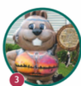
"Punksutenink Phil" Sponsored by: Marion Center National Bank, 514 West Mahoning St.