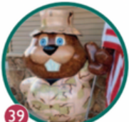
"Sgt. Major Phil" Sponsored by: VFW Post 2076, 121 Maple Ave.